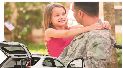
Scooter lifts, turning seats, and driving accessories