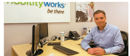
Certified Mobility Consultants Provide Comprehensive Needs Analysis

MobilityWorks is committed to serving you. Contact us today so we can evaluate your needs and find a solution that best fits your lifestyle.