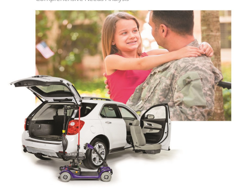
Scooter lifts, turning seats, and driving accessories