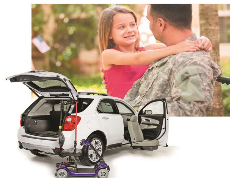
Scooter lifts, turning seats, and driving accessories