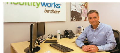
Certified Mobility Consultants Provide Comprehensive Needs Analysis

MobilityWorks is committed to serving you. Contact us today so we can evaluate your needs and find a solution that best fits your lifestyle.