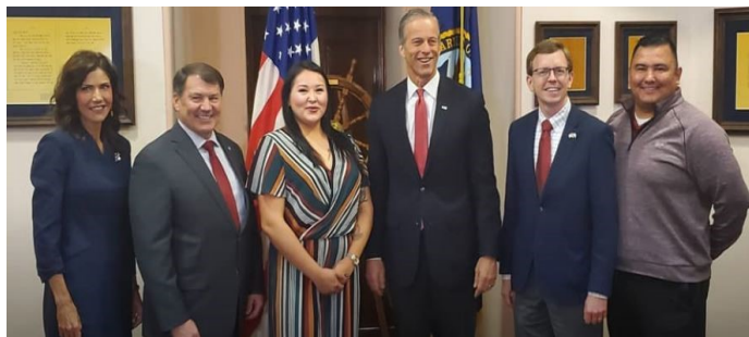
Governor's press conference announcing VA's decision:

Before departing South Dakota, Secretary Wilkie also visited the Vet Center in Rapid City.